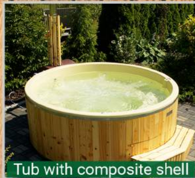
Tub with composite shell