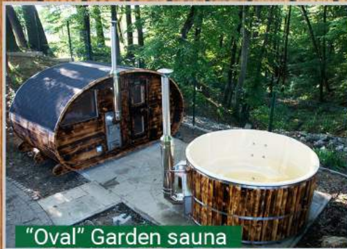
"Oval" Garden sauna