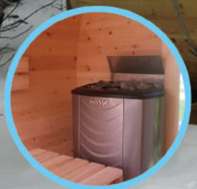
"HARVIA" ELECTRIC HEATER

We own and offer our unique in-house solution of wall log joints which prevents the penetration of water, precipitation and prevents the effects of wood drying out, which is significant for the life of the sauna. Our key joint is protected with the law of Republic of Poland – we were the first in the world to apply this solution. The vertical walls are made of laminated wood (water-proof joint).