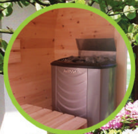
"HARVIA" ELECTRIC HEATER