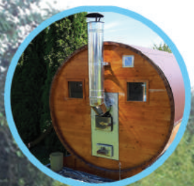
"DIABAZ" STOVE - EXTERNAL OPERATION