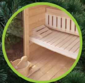
INSIDE THE SAUNA