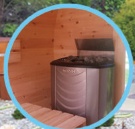
"HARVIA" ELECTRIC HEATER

The garden saunas manufactured by our company exhibit multiple advantages, the most important of which being the fact that it may be used both as a Finnish sauna with a temperature of approximately 100°C and humidity of 5-10%, as a Russian sauna - banya with a temperature of approx. 65-80°C and humidity of 10-30%, as well as a steam sauna.