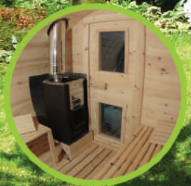
"HARVIA" WOOD-FIRED STOVE