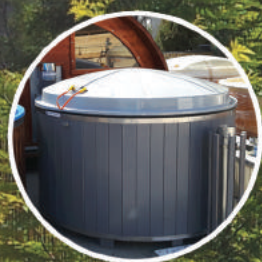
TUB WITH A COVER