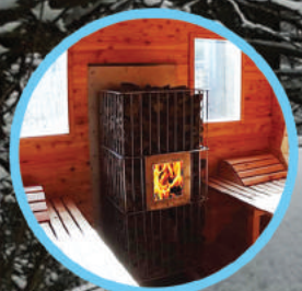
"DIABAZ" WOOD-FIRED STOVE