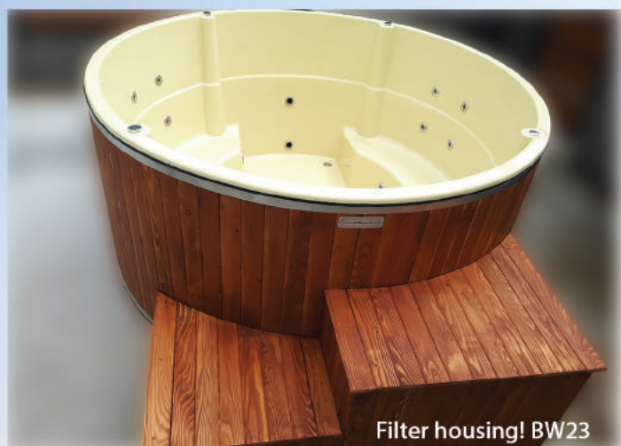
Filter housing! BW23