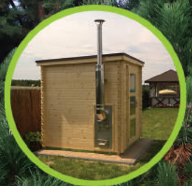
"DIABAZ" WOOD-FIRED STOVE