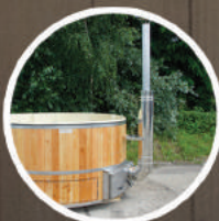
STOVE INSTALLED UNDER BENCH